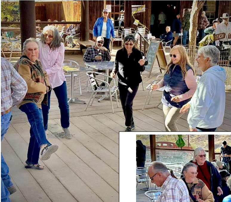
Dancin' at the Desert Bar!